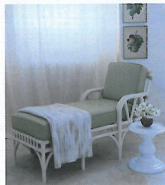
wooden flooring by PDQ; 'Alsop' table from Davidson London; Soane's 'Isis' rattan daybed, upholstered in 'Catulpa Old Flax' fabric