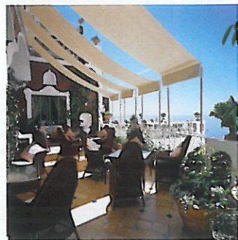
From top: blond 'Klismos' chair from Virginia White; 'Ivy' chandelier from Porta Romana; terrace at Le Sirenuse; 'Dolcevita' bed from Natuzzi;