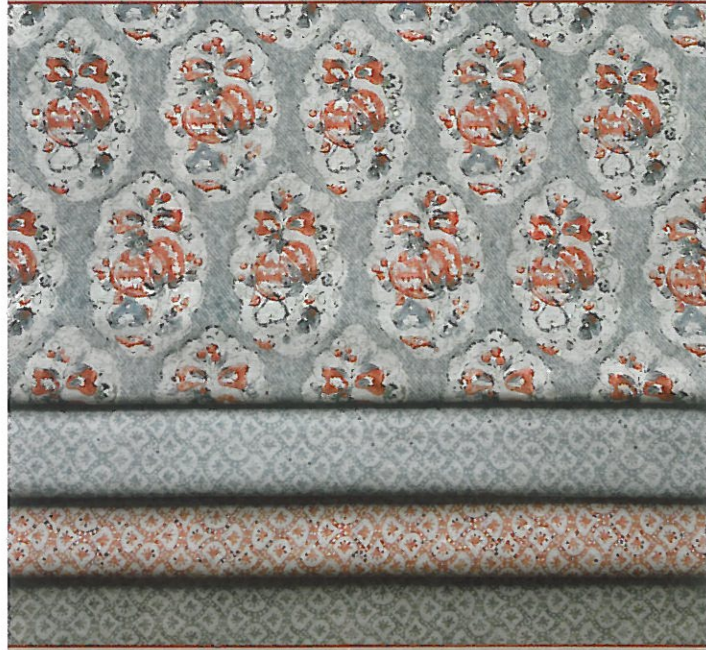
Large Design: Melograno, Small Design: Strapwork

118 Lots Road London SW10 0RJ | 020 7376 5596 enquiries@nicholasherbert.com | www.nicholasherbert.com