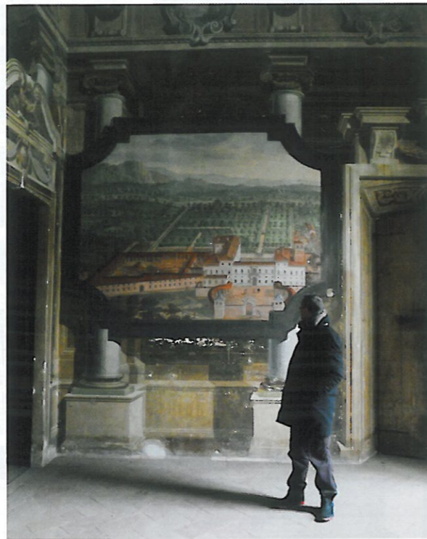
Photographer Bill Batten surveys a 17th-century view of the Palazzo Arese Borromeo and its adjacent park (see Interiors Modern, pages 146-168)